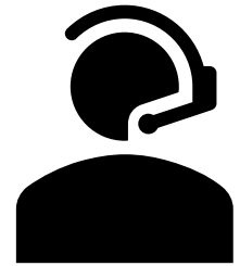
Law Firm Leader Interviews